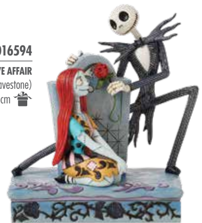
6016594 A GRAVE AFFAIR (Jack & Sally Gravestone) Height: 16.0cm