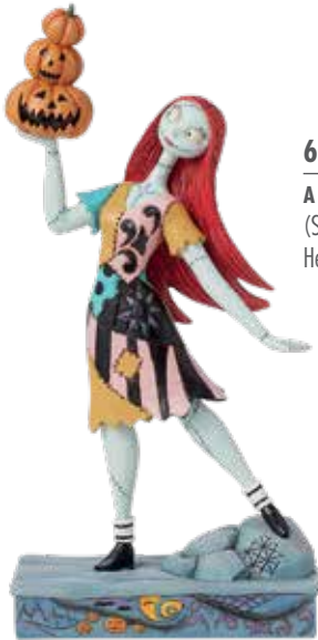
6016593 A STACK OF JACKS (Sally with Pumpkins) Height: 23.0cm