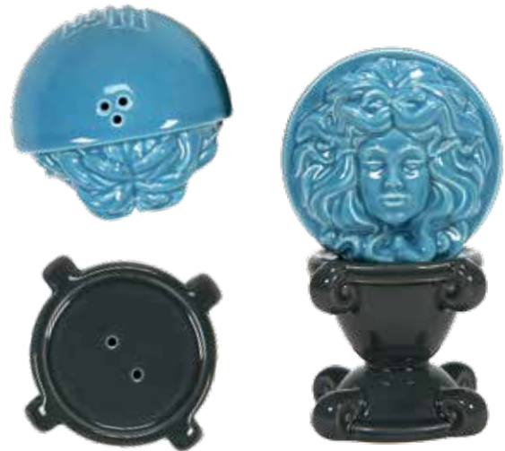
6016750 MADAME LEOTA SALT AND PEPPER SHAKER SET Height: 6.0cm 📺