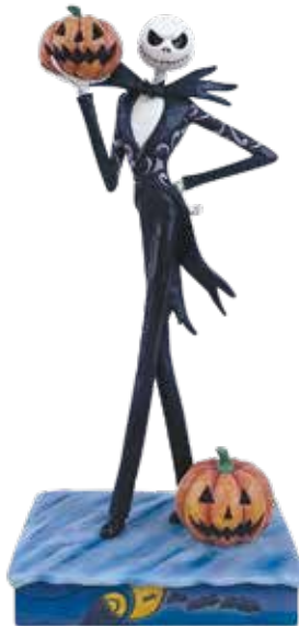
6016592 FRIGHTFUL FUN (Jack with Jack-O-Lanterns) Height: 23.5cm