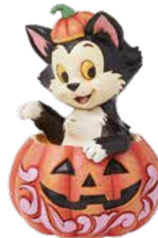
6016583 FIGARO IN A PUMPKIN MINI FIGURINE Height: 9.5cm 📺