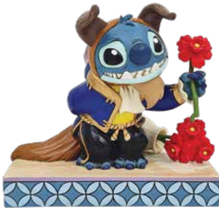
6016599 BEAUTY AND THE STITCH (Beast Stitch) Height: 13.5cm 📺