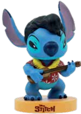
6016714 HAWAIIAN ELVIS STITCH Height: 11.5cm 📦

Grand Jester Studios is always proud to showcase new and innovative products — which are instantly memorable and collectible — featuring fan-favourite Disney characters!