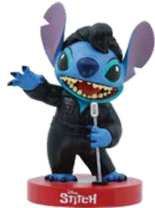
6016712 BLACK LEATHER ELVIS STITCH Height: 11.5cm 📦