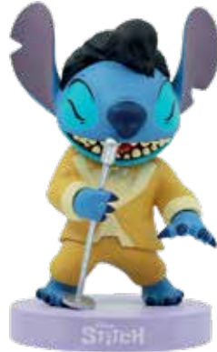
6016713 GOLD LAME ELVIS STITCH Height: 11.5cm 📦