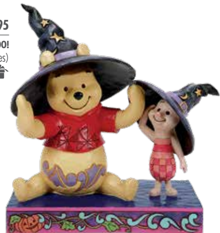
6016595 WINNIE THE BOO! (Winnie the Pooh & Piglet Witches) Height: 15.0cm 📺