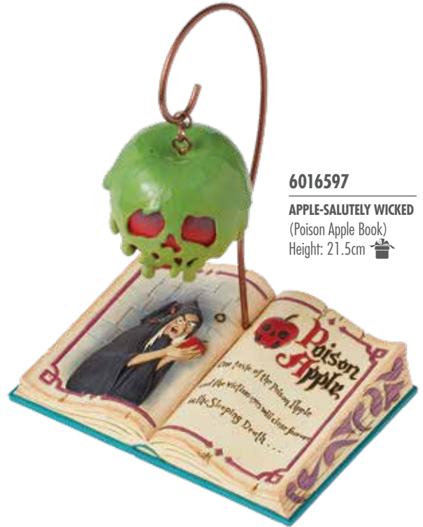
6016597 APPLE-SALUTELY WICKED (Poison Apple Book) Height: 21.5cm 📺