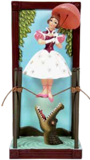
6016745 HAUNTED MANSION STRETCHING CANVAS TIGHTROPE GIRL Height: 20.0cm 📺