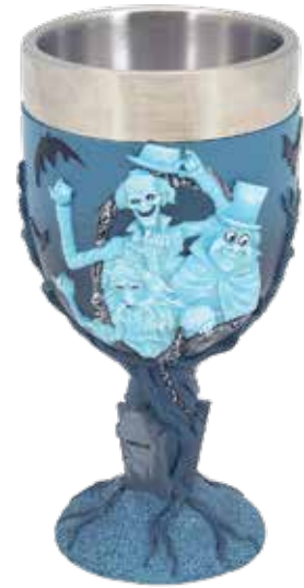
6016749 HAUNTED MANSION GRINNING GHOST GOBLET Height: 18.0cm 📺