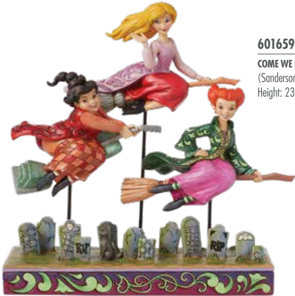
6016591 COME WE FLY (Sanderson Sisters) Height: 23.5cm 📺