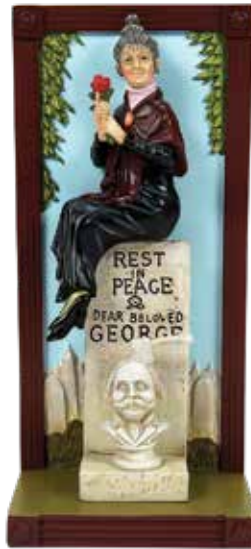
6016746 HAUNTED MANSION STRETCHING CANVAS GEORGE'S WIDOW Height: 20.0cm 📺